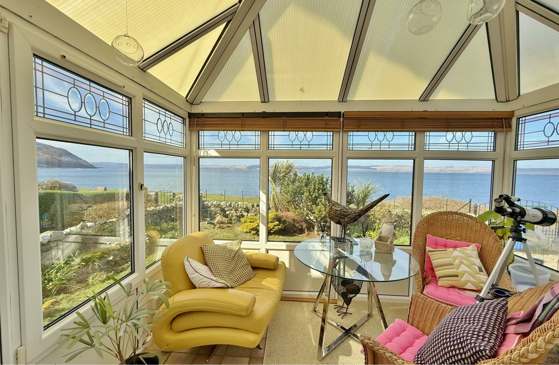
Bayvoyach Catacol, Isle of Arran, KA27 8HN